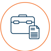
Business & corporate